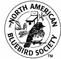
NCBS is an affiliate of NABS.

PUBLISHED BY The North Carolina Bluebird Society ncbluebird.com