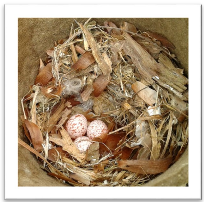
Photo of Brown-headed Nuthatch nest with eggs at White Deer Park in Garner

You can put out a nest box to assist this little songbird overcome challenges finding nesting sites.