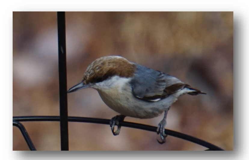
Brown-headed Nuthatch in Knightdale. See more pictures & story on page 13