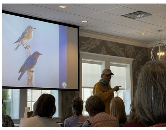
A flurry of excellent questions and discussion continued

There were many exchanges with questions. People were very interested and our presentation went a bit beyond the scheduled time. But the talk was all bluebirds.