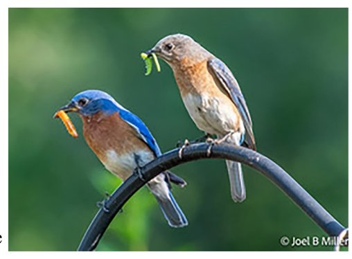
Colorful Grub(s) ... May 26, 2021

2nd: Both parents show up at the same time with a colorful grub for the hatchlings