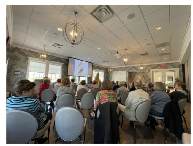
46 club members and guests were enthralled learning the joys of caring for bluebirds