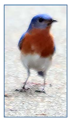
Bluebird